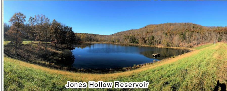
Jones Hollow Reservoir